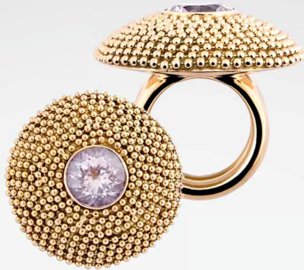
Ring with morganite