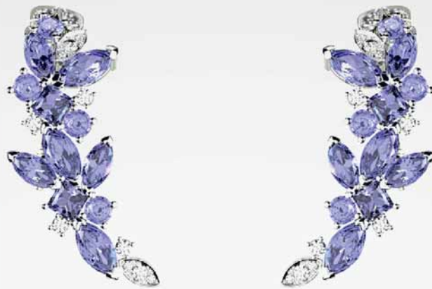
Earrings in 18ct whitegold with tanzanites and diamonds