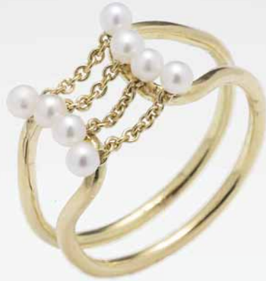
Ring in 18ct yellowgold with freshwater pearls