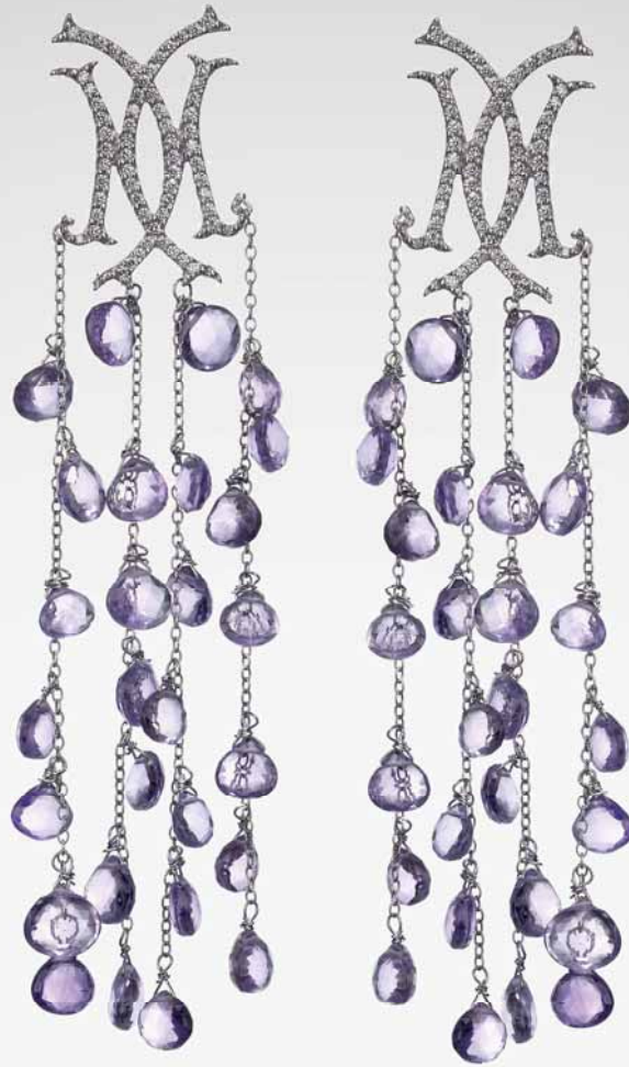
Earrings in 18ct whitegold with tanzanite drops and diamonds