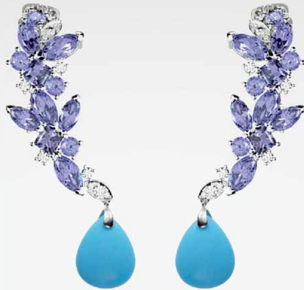
Earrings in 18ct whitegold with tanzanites, diamonds and turquoise drops