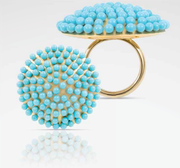
Ring with turquoise beads