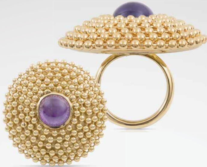
Ring with amethyst stone