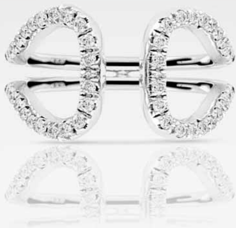
Ring in 18ct with diamonds