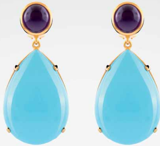
Earrings with turquoise drop and amethyst stone