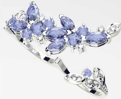
Ring in 18ct whitegold with tanzanites and diamonds